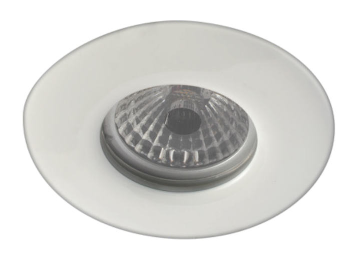
Shown with LED Module - Not included